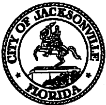
Exhibit 2 (Page 1 of 1)